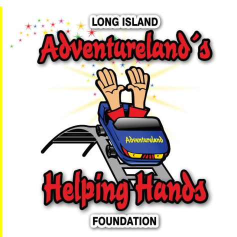
Lending a Helping Hand to our Long Island Communities